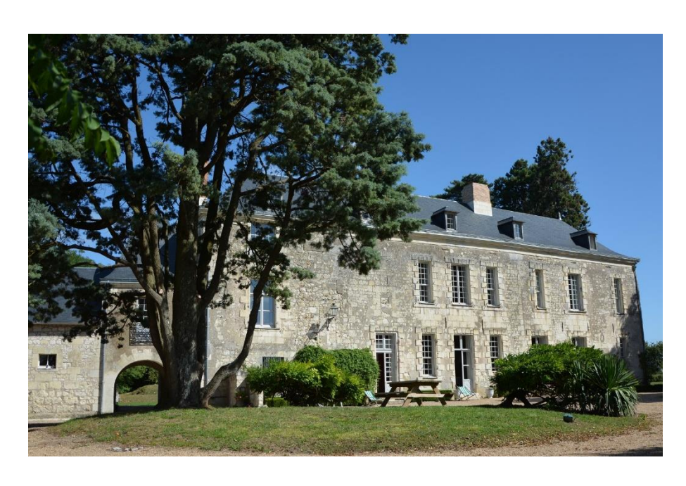
Lunch at your leisure.

The vines of this estate are ideally spread out over the entire "terroir" covered by the appellation, from the gravel shores along the Loire River to the clay, limestone and sandy soils of the hills overlooking the valley. The red and rosé wines produced in the domain are presented under the appellation "Bourgueil" AOC. They stem 100% from the "Cabernet Franc" grape introduced by the monks of the Abbey in the 11th century.