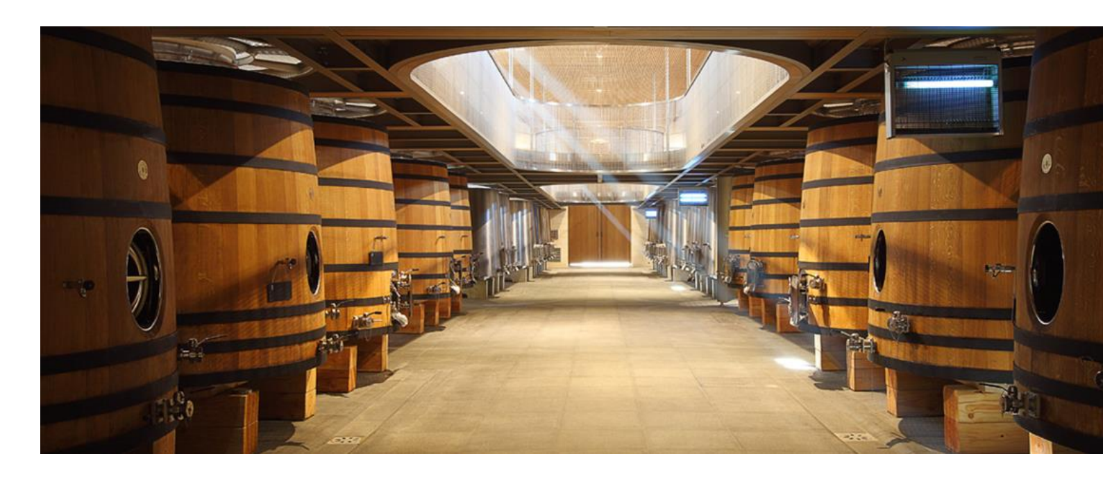
Lunch at your leisure in Pauillac.

You'll start your day at a winery located along the Castle Road. Enjoy a visit of the property and discover the impeccably maintained mechanical installations to understand more of the whole wine making process. After that visit, it'll be time to experience your first commented wine tasting session. This will be a chance to gain an excellent understanding of the wines produced right there, whether as an introduction to wines in general or to expand on your existing knowledge.