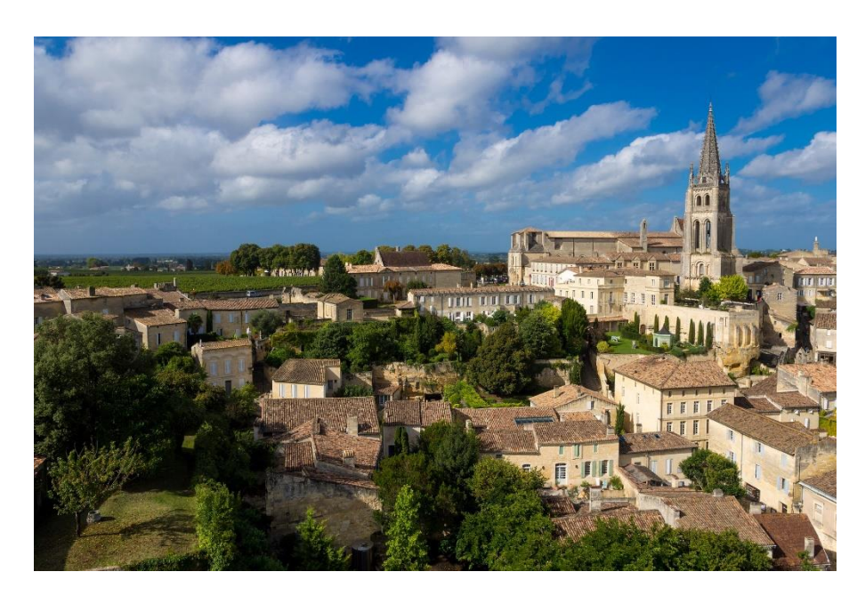
Lunch will be at your leisure.

The village takes its name from a local Benedictine Monk who went by the name of Emilian, responsible for the creation of the uniquely designed limestone church at the heart of the village. Today, Saint-Emilion is also famous for its fascinating romanesque churches and ruins that appear all along the steep and narrow streets punctuated by cafés and boutiques of the terroir.