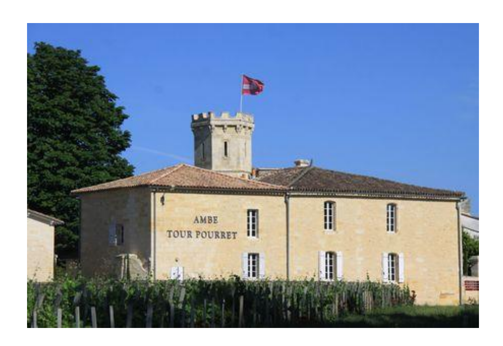
On to another visit of a Classified Growth Chateau in the Village That visit will be followed by a commented tasting that takes place in the village and will include wines from the

That visit will be followed by a commented tasting that takes place in the village and will include wines from the surrounding appellations such as Pomerol, Cotes de Castillon, Lussac, Montagne or Saint Georges Saint Emilion.