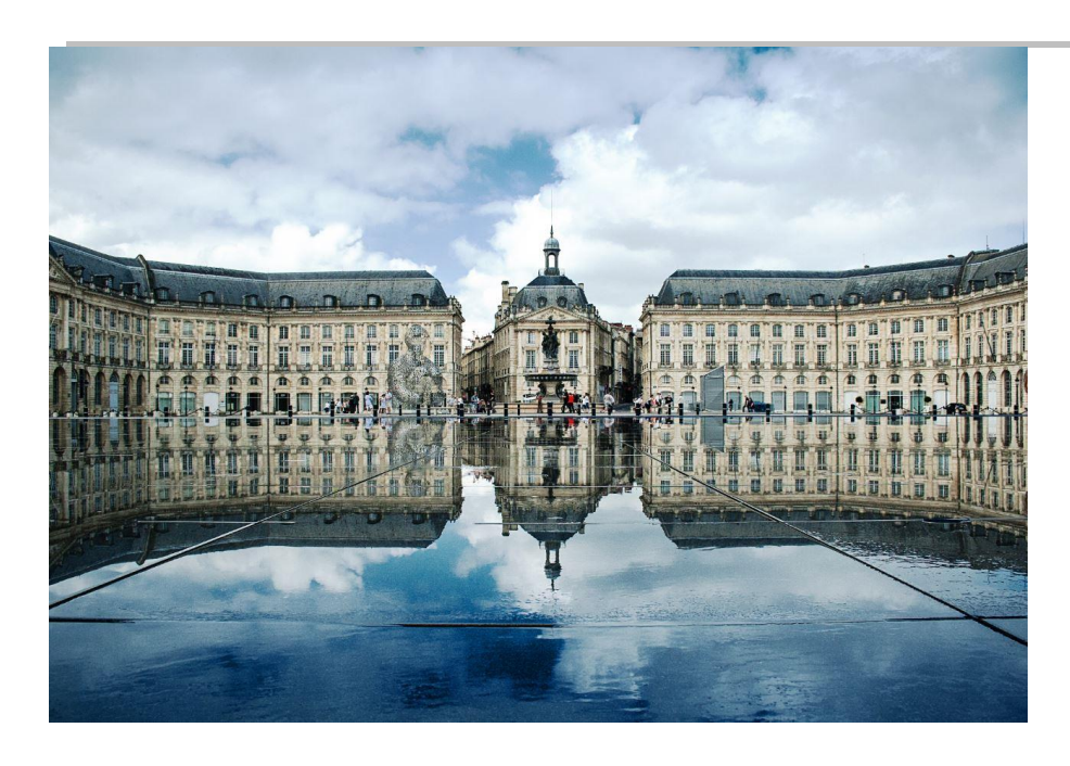
DAY 6: MEDOC, PAULLIAC, VISIT AND WINE TASTING 3 WINERIES

Pick up is at 9:20 AM at the Bordeaux Tourist Office.